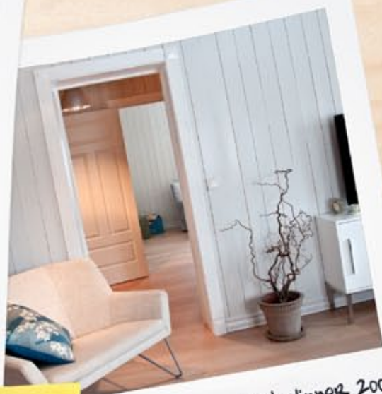
Interior award winner 2009 50 000,- in prize.

Deadline for submission Nov. 1 each year! Remember!! take pictures!