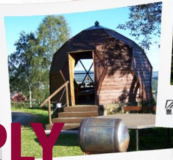
Finalist open class 2011 10 000,- in prize.