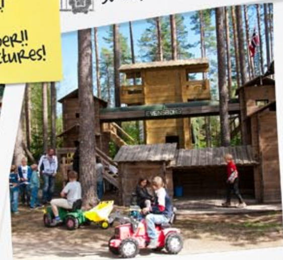
The children wood award 2010 10 000,- in prize