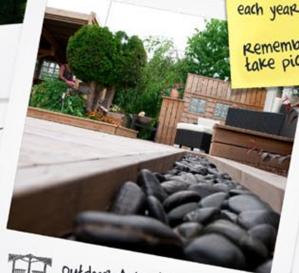
Outdoor Award 2009 50 000,- prize

Deadline for submission Nov. 1 each year! Remember!! take pictures!