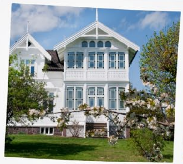
Exterior award Winner 2010 100 000,- prize